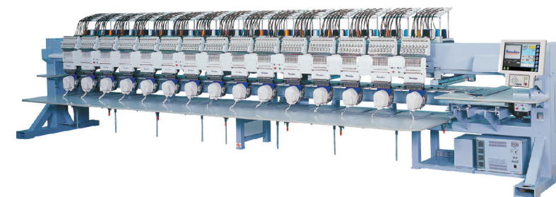
15-Head - BEKS-S1515C

Heavy-duty, steel construction provides stability and minimum vibration resulting in superior stitch quality, designed to be compact and powerful. Our 2-8 head machines will fit through most standard doors so you can set up shop almost anywhere.