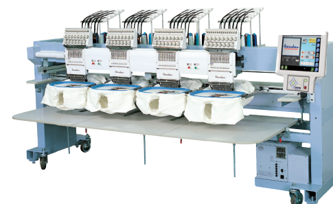
4-Head - BEKY-S1504CII