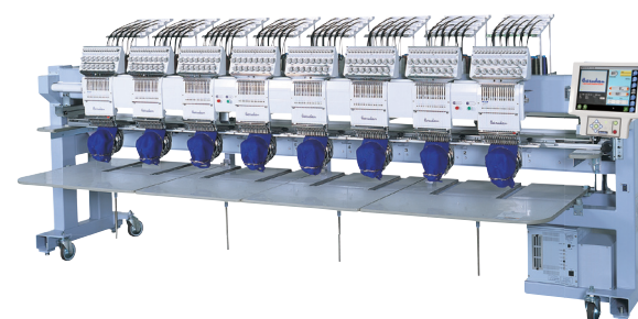
8-Head - BEKY-S1508CII